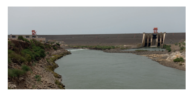
Water management in Sudan: the Upper Atbara Dam

To initiate measures against a variety of extreme events at an early stage, it is required to combine seasonal forecasts covering several months with those of shorter horizons from two to six weeks in advance. Within the joint project SPS-Blue Nile, participants from science, politics and water management are therefore developing methods to