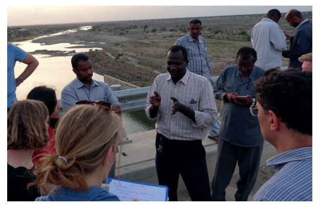
Close exchange of all project participants on site

The project closely involves local partners from Ethiopia and Sudan. Regular workshops and training courses online and in the target region as well as the exchange of PhD students ensure co-development of the SPS Blue Nile prediction system. Researchers share their methods and information and carry out joint research activities. A close involment of participants in politics and water management in both countries allows for a transfer of results into practice and thus a sustainable implementation of the developed methods beyond project completion.