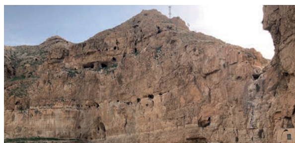
Rock formations with joints and faults can store water

penetration of rainwater from the surface. Joints and faults, however, allow a certain amount of water to flow through the layers of rock far more quickly, even within just a few hours. This sometimes makes it extremely hard to predict when groundwater recharge will occur. Earlier investigations also show that, in the region under investigation, the rock formations between the groundwater table and the surface of the earth are important in the area of water management because they serve as longterm water storage media, meaning they can be factored into water management considerations for periods of drought.