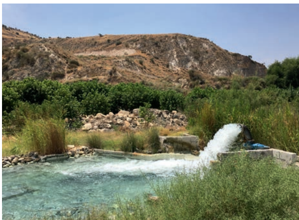
Artesian Mukeihbeh well field ( Jordan). In this artesian aquifer, water flows to the ground surface under natural pressure.

The Yarmouk River is the main tributary of the River Jordan and at the same time an important strategic drinking water resource for Syria, Jordan, and Israel. Owing to the relatively heavy rainfall in the Yarmouk drainage basin, this area is crucial for the ecology of the entire Lower Jordan Valley and the Dead Sea. It is vital for farmland irrigation in the region and since 2020 has been supplying some ten percent of the population of Jordan with water through the Wadi Al Arab System II water conveyance project. Surface water runoff, however, is strictly controlled by upstream dam structures. The only thing keeping the river alive is the groundwater that flows from the Ajloun area of Jordan.