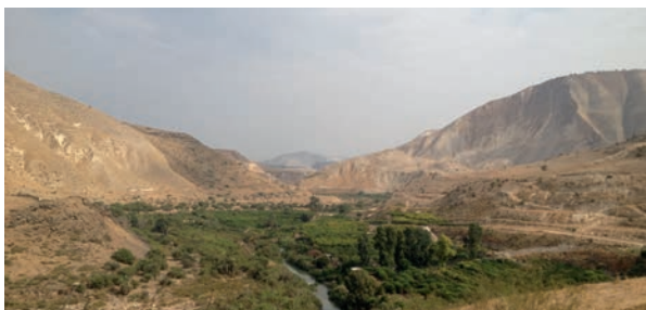
View of the Yarmouk Gorge

TransFresh will play an important role in achieving a stable water supply from the Yarmouk basin over the long term, improving relations between the riparian countries at the same time. Stakeholders and decision-makers will be involved throughout the entire project development process; this will help deliver practical results that are transferable to real-life scenarios. In fact, the key concept behind this project sees the methods developed being transferred to other regions with transboundary water resources.