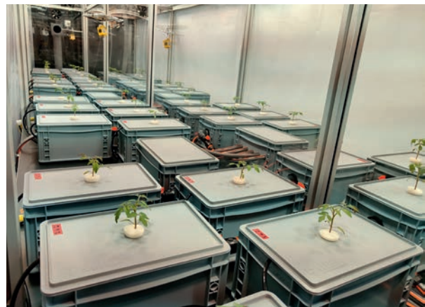
Test setup to investigate the optimum growth conditions depending on nutrient solution salt concentration levels at the Hohenheim University Phytotechnical Center

At the heart of the combined process developed as part of the EXALT project is a closed loop cooling process which achieves the perfect balance between humidity and temperature in the greenhouse, ensuring the best possible conditions for plant growth. Instead of controlling these parameters using an air exchange system, as is usually the case, a heat pump actively extracts heat from the greenhouse. Thanks to the lower temperatures, the water that evaporates via the plant leaves can condense, be recovered, and reused for irrigation.