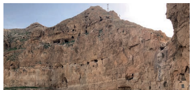
Rock formations with joints and faults can store water

penetration of rainwater from the surface. Joints and faults, however, allow a certain amount of water to flow through the layers of rock far more quickly, even within just a few hours. This sometimes makes it extremely hard to predict when groundwater recharge will occur. Earlier investigations also show that, in the region under investigation, the rock formations between the groundwater table and the surface of the earth are important in the area of water management because they serve as long-term water storage media, meaning they can be factored into water management considerations for periods of drought.