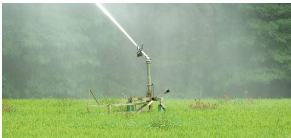
Irrigation (here in rice cultivation in Ticino, Switzerland) protects plants from drought as long as sufficient water is available

The choice of indicators to be modelled, as well as the way in which information is provided, will be jointly determined with regional pilot users in East Africa and West Asia. They will also help to validate the predicative quality for drought management in their region.